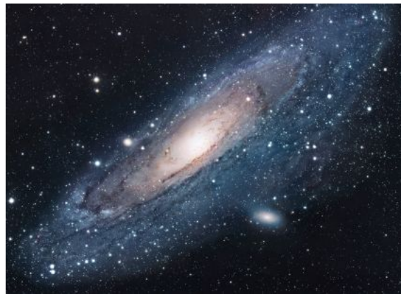
Figure 2.1: Artistic view of the Milky Way

In an essay, article, or book, an introduction (also known as a prolegomenon) is a beginning section which states the purpose and goals of the following writing. This is generally followed by the body and conclusion (see 2.1).